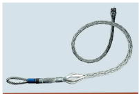
Heavy Duty Grips