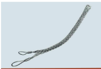
Light-Medium Duty Cable Grips