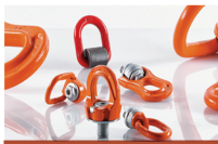
ProfiLift Lifting Points